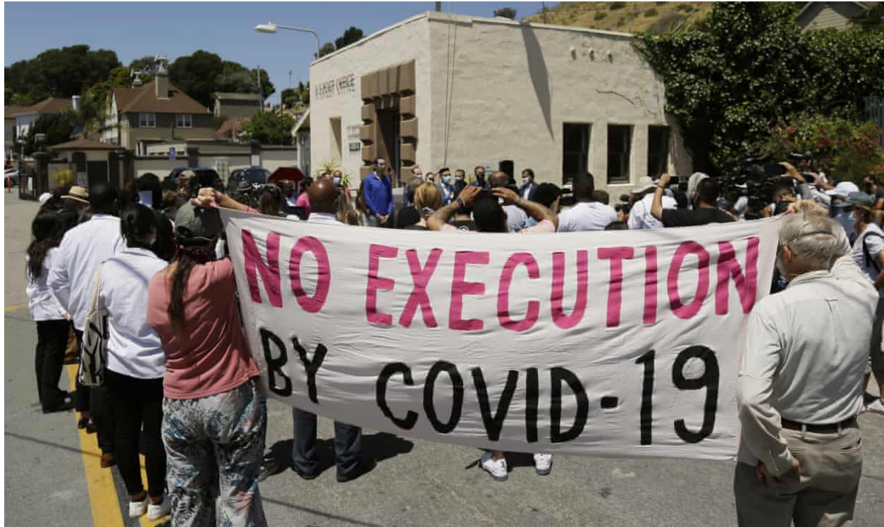
People hold up a banner while listening to a news conference outside the San Quentin state prison in San Quentin, California, in July 2020.

Last modified on Sun 3 Dec 2023 17.03 EST